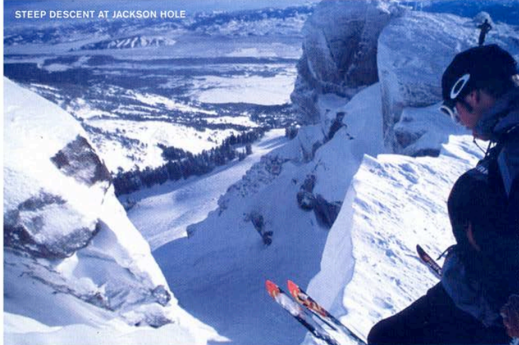
STEEP DESCENT AT JACKSON HOLE